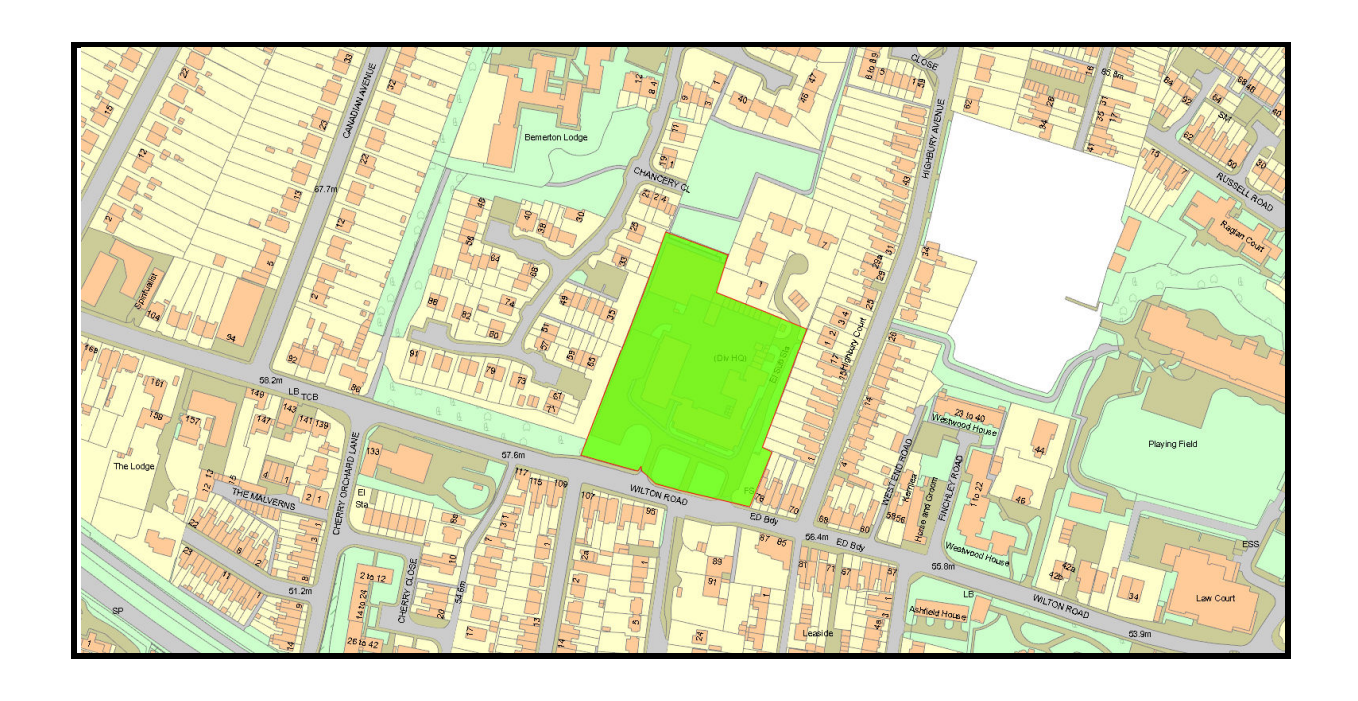
13/02939/FUL - Salisbury Divisional Police HQ, Wilton Road, Salisbury SP2 7HR